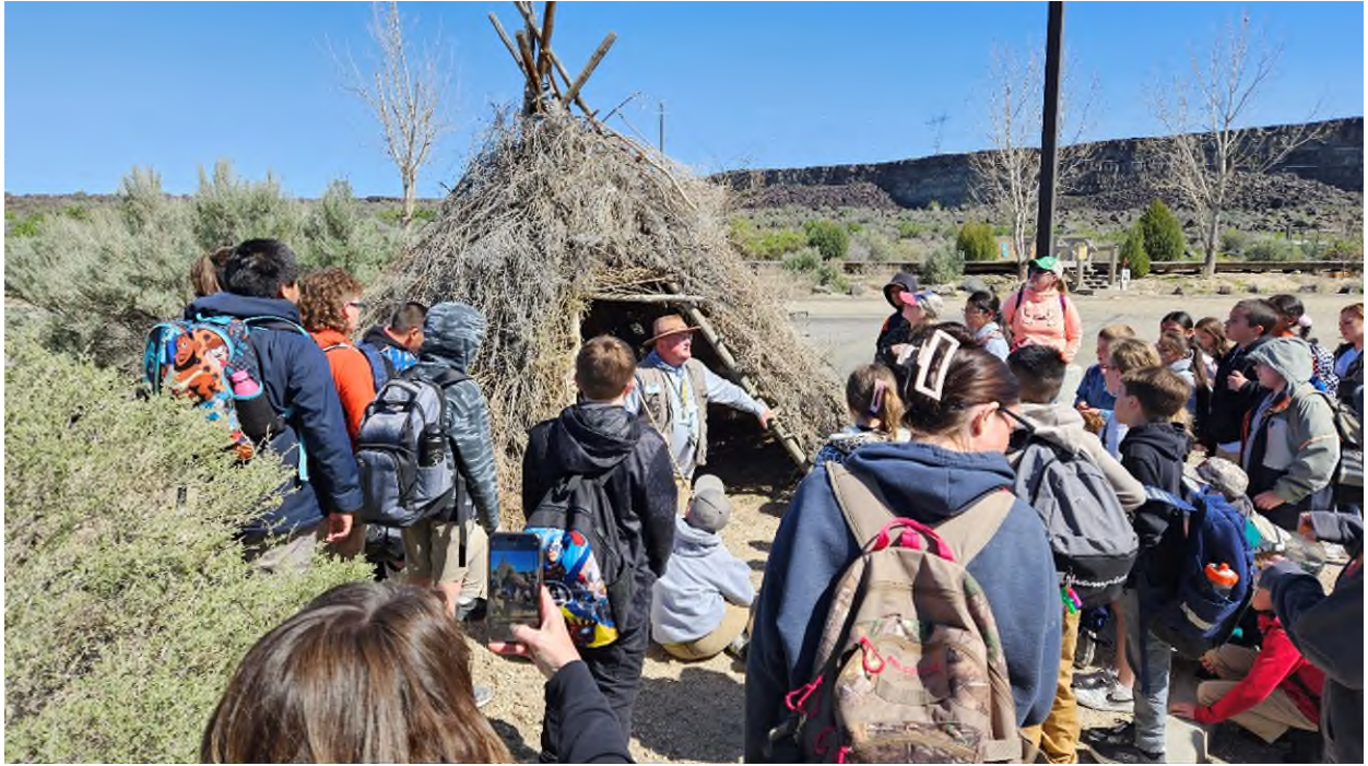
Children enjoying the existing Wickiup in the main parking lot island.