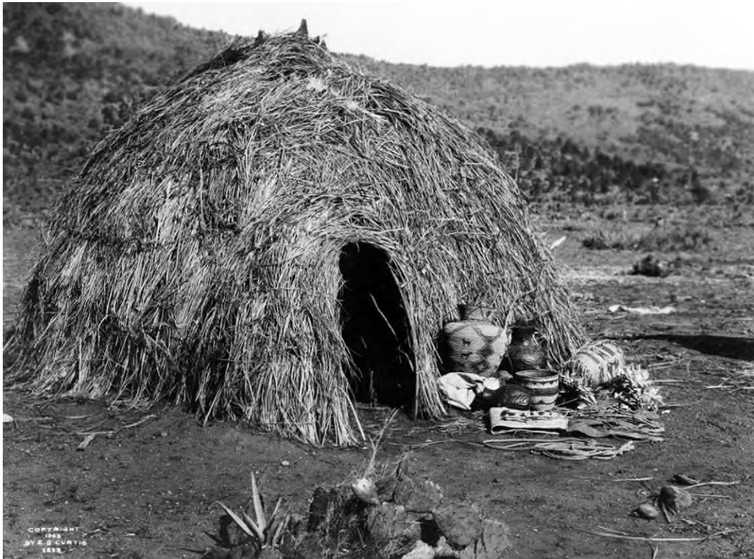
Conical Wickiup Style