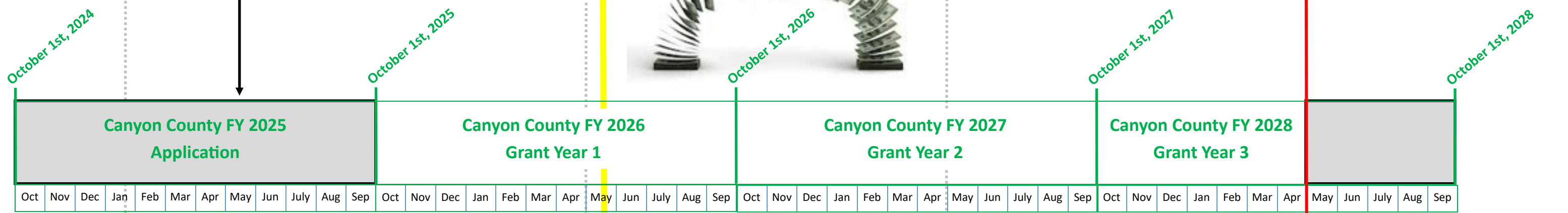
Canyon County Fiscal Year Timeline