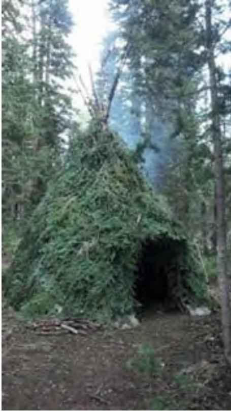
A-frame style of Wickiup